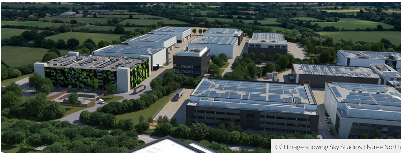
CGI Image showing Sky Studios Elstree North

We've received lots of insightful feedback and thoughtful suggestions in the consultation period and we wanted to share a summary of what we heard and how we're already responding to your feedback.