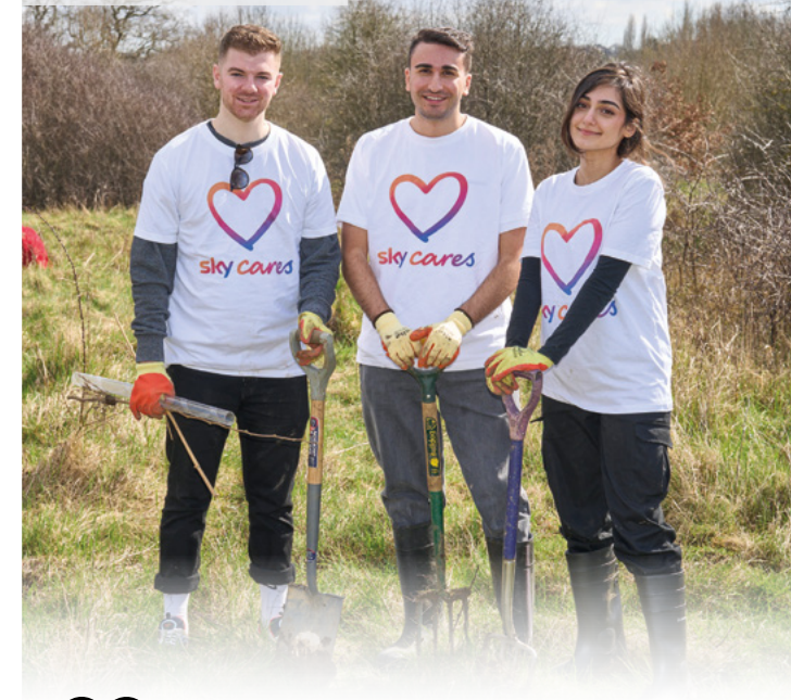
Tree planting at Parkfields, Borehamwood

We're helping Gratitude fight hunger and food waste through donations, volunteers, a special Christmas campaign and by naming them a Sky Up Hub which provides them with free broadband. We're in the process of onboarding others and we're also working with environmental charities such as The Conservation Volunteers, Planet Patrol and the Marine Conservation Society to see what specific green schemes we can support locally. We have already planted 500 trees in the local Parkfields & Allum Lane Spinney , and we're excited to explore more initiatives.