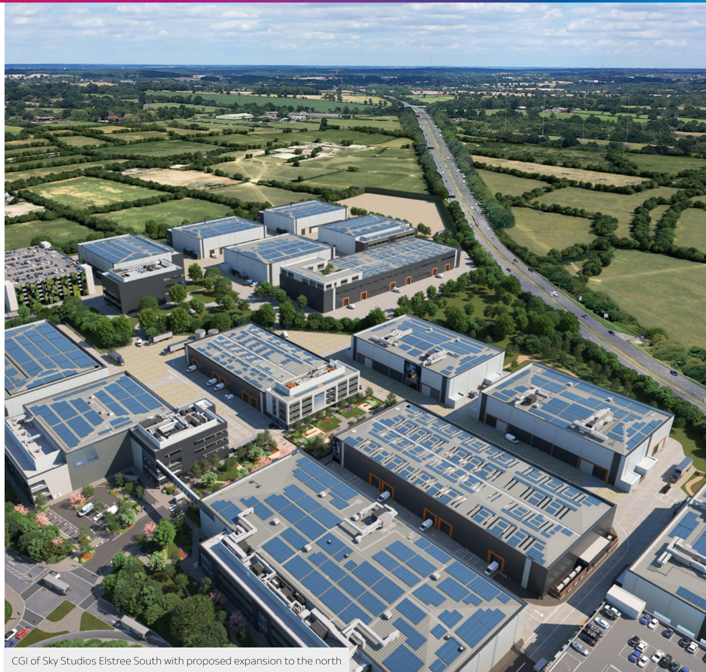
CGI of Sky Studios Elstree South with proposed expansion to the north