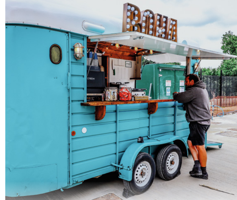
Local caterer 'Boha'

We are supporting the local economy by working with local suppliers across a range of categories , from signage to catering to office furniture with partnerships varying from smaller, one-off contracts to seven figure contracts of significant scale. We are also building a local suppliers list which will include everything from taxi companies to local shops and hardware stores. This list will be shared with productions when they are working at Sky Studios Elstree to encourage further spend with local businesses.